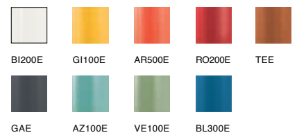
GAE AZ100E VE100E BL300E