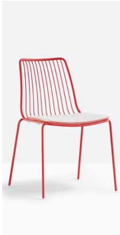
NOLITA 3651 WITH CUSHION