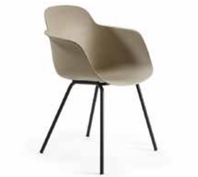
SICLA 4 LEG