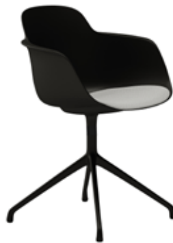
SICLA 4 WAY WITH SEAT PAD