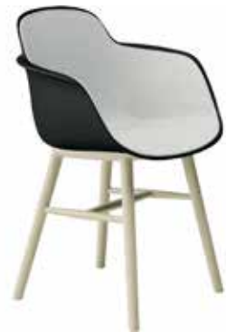
SICLA TIMBER WITH INNER UPHOLSTERED