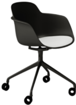
SICLA 4 WAY WITH CASTORS