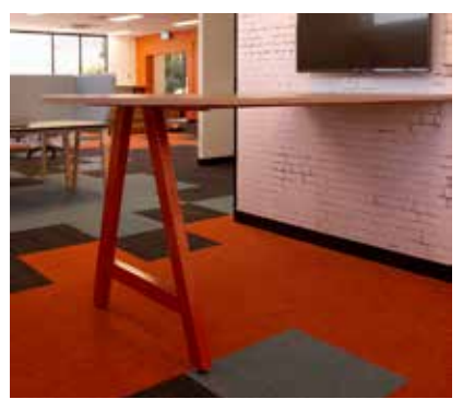
BOLD WALL MOUNTED BENCH