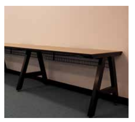
BOLD SINGLE WORKSTATION