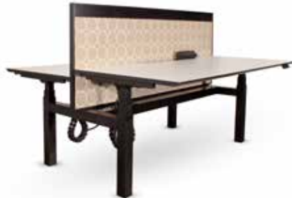
35MM STATIC SCREEN FIXED TO BRIDGE