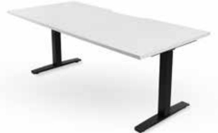
FREESTANDING FLIGHT WITH FEET