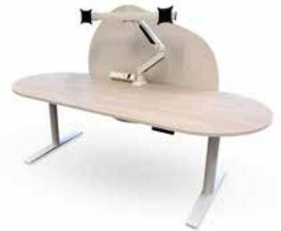
FREESTANDING RONDO WITH FEET & ECLIPSE SHAPE SCREEN