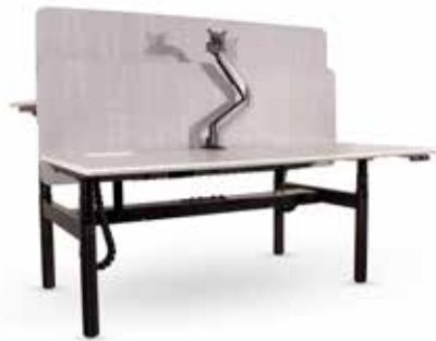
STRAIGHT ECLIPSE SCREENS (INDIVIDUAL PER WORKPOINT)