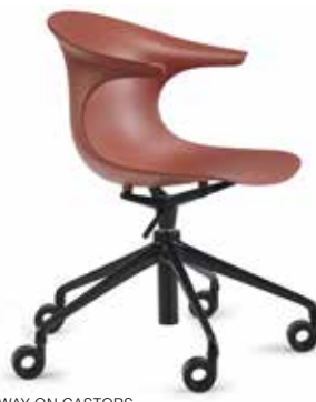
LOOP 5 WAY ON CASTORS