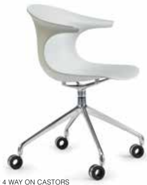
LOOP 4 WAY ON CASTORS