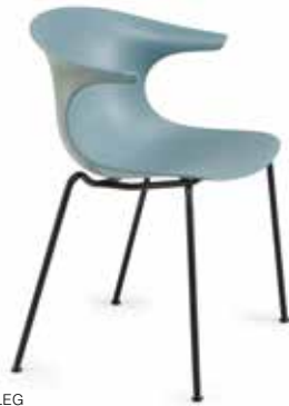
LOOP 4 LEG