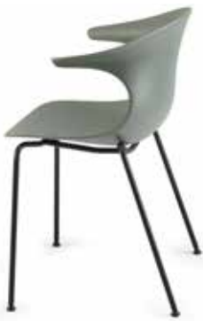
LOOP 4 LEG