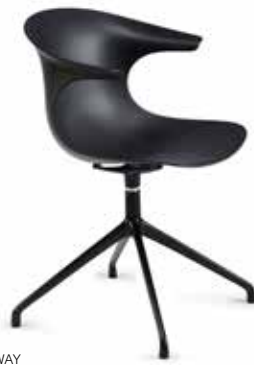
LOOP 4 WAY