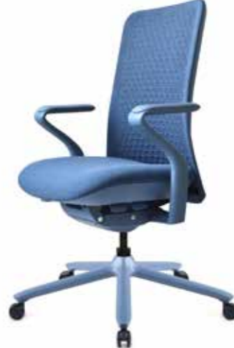
3D Knitted fabric covers the entire backrest providing elastic support, whilst the triangular pattern provides excellent breathability and sophisticated design.