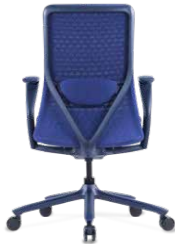
Armrests feature a soft PU pad for comfort and the easy to use 'click and forget' ratchet mechanism allows easy height adjustment of the armrest.