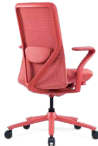
The V-shaped back frame and moulded foam seat cushion provides a comfortable and ergonomic sitting experience.