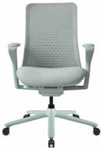
Intuitive and smart design are part of the Fuse DNA.