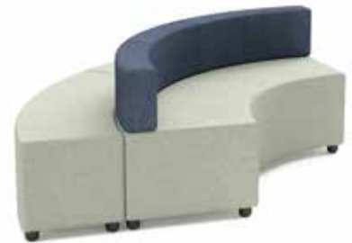
DRIFT CURVE WITH BACK