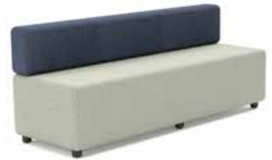
DRIFT STRAIGHT WITH BACK