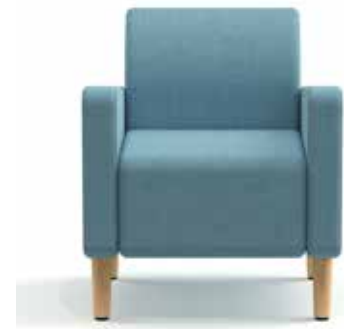
LOGAN SINGLE SEAT WITH ARMS ON TIMBER LEGS