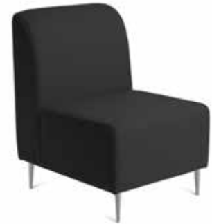
LOGAN SINGLE SEAT WITHOUT ARMS ON BRUSHED ALUMINIUM LEGS