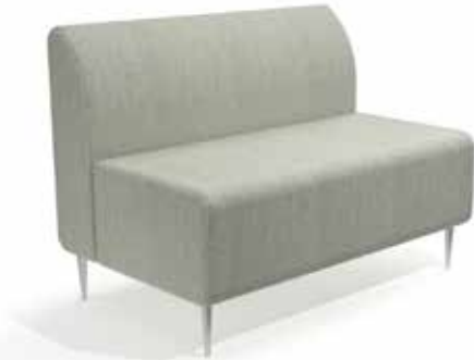
LOGAN 2 SEATER WITHOUT ARMS ON BRUSHED ALUMINIUM LEGS