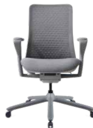
Intuitive and smart design are part of the Fuse DNA.