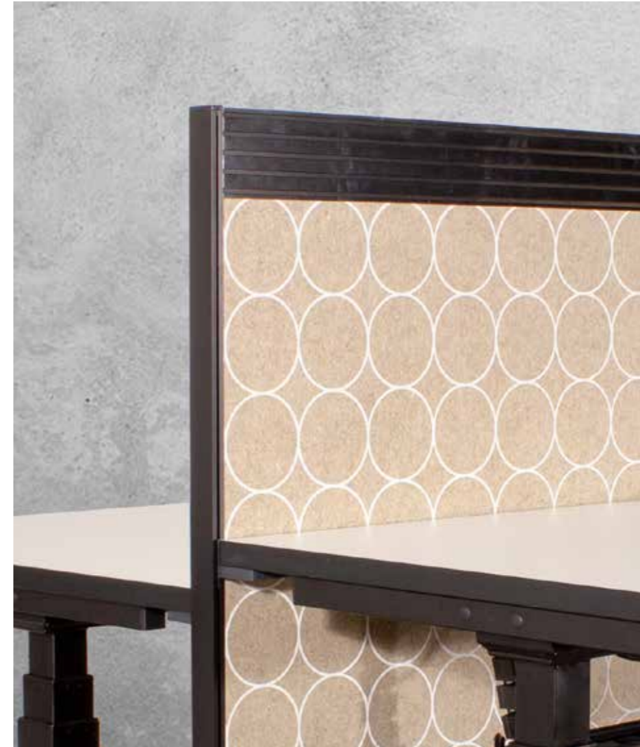
FAR LEFT: 35mm Aluminium Frame Screen LEFT: 35mm Aluminium Frame Screen with Function Rail